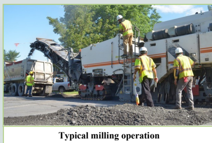
Typical milling operation

4. Pavement milling - This involves the grinding off of the existing roadway pavement as well as the pavement near curbs and driveways allows the new pavement to