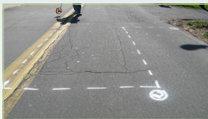
Typical survey paint markings

Generally, the work will proceed as follows: