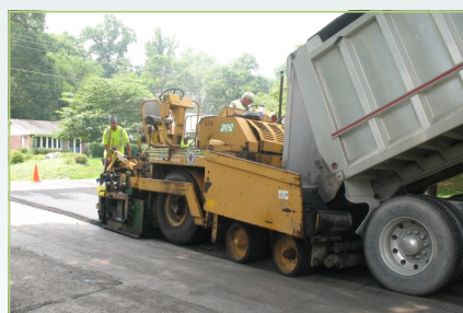
Typical asphalt paving operation

5. Utility Adjustments - Sewer and storm drain manholes, water valves and gas valves, and other underground utility access covers need to be elevated to the same grade as the newly proposed pavement; usually 1" to 2". During construction activities, all utility surface adjustments will be maintained by the placement of temporary asphalt ramps until placement of the final paving occurs.